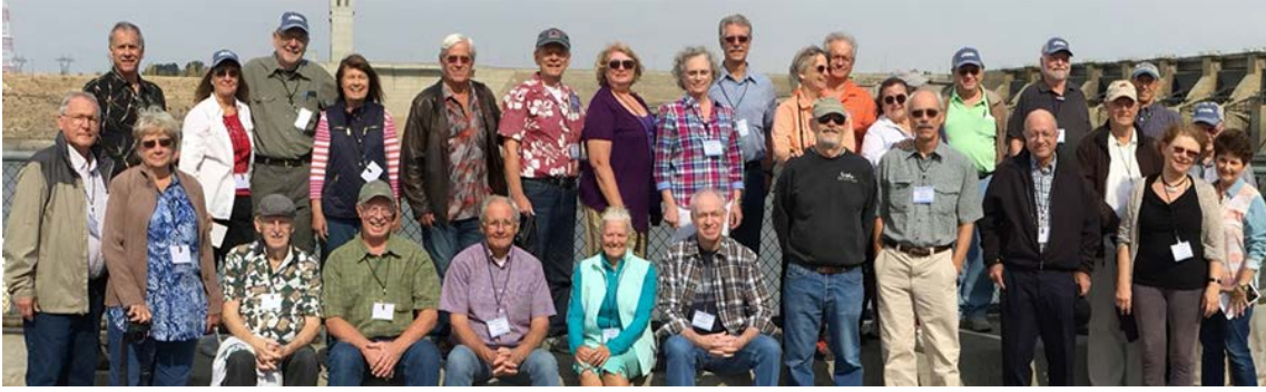
Ice Harbor Dam

The attendees also gave high marks to the Ice Harbor Dam tour (maybe because many are engineers?) although watching the fish swim up the ladders was pretty cool. Several people also enjoyed a tour of a wetland treatment project near Ice Harbor Dam – a lucky opportunity.