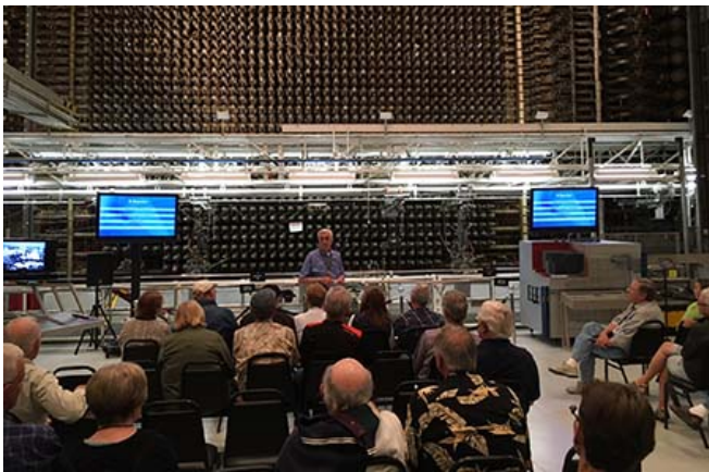
Reactor B and massive number of reactor tubes