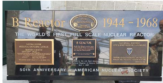
50th Anniversary plaque