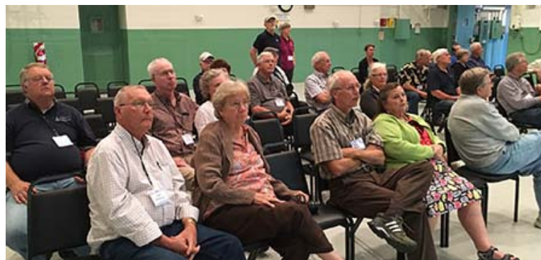
Left side of group at Reactor B presentation