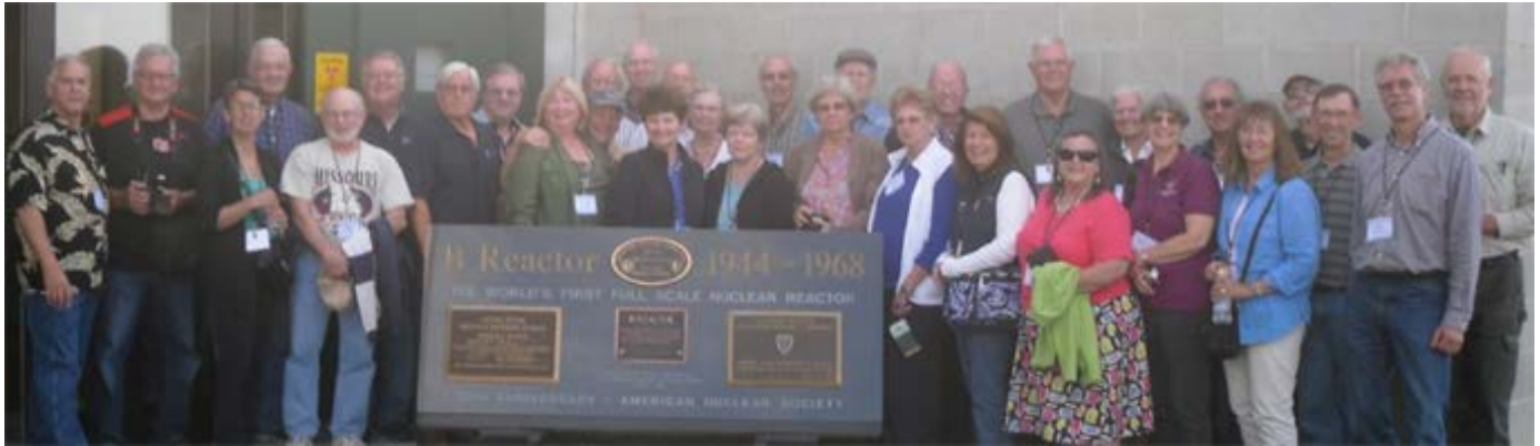
Group outside Hanford B Reactor