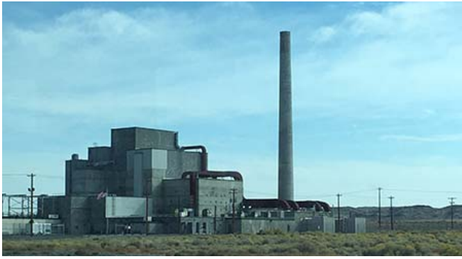
B Reactor Building at Hanford