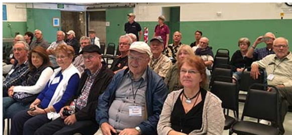
Attendees enjoyed the presentation at Hanford B Reactor